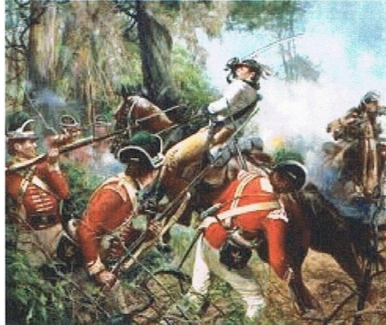
Ambush at Thomas Creek